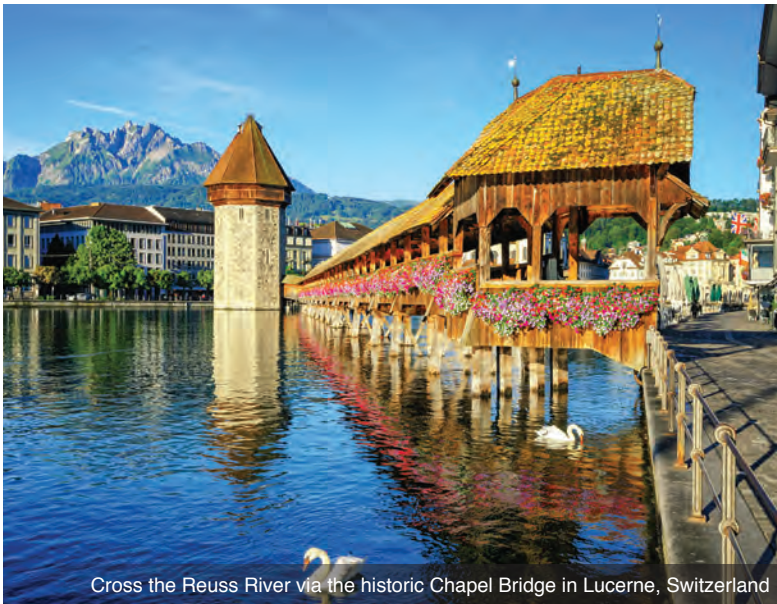
Cross the Reuss River via the historic Chapel Bridge in Lucerne, Switzerland

DAY 8 Breisach, Germany: On today's adventure, visit a typical Black Forest village, full of charm, cuckoo clocks and other German specialties. Alternatively, take part in a guided hike along some of the Black Forest trails. Meals: B, L, D