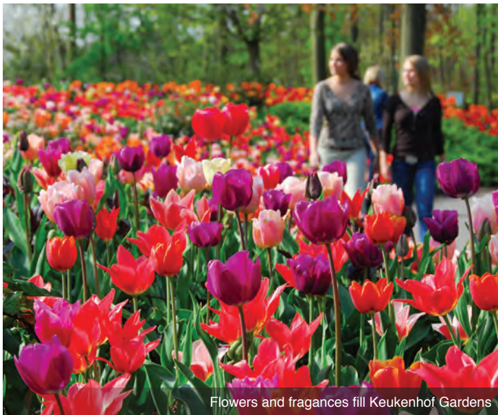
Flowers and fragrances fill Keukenhof Gardens