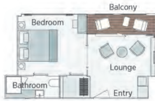
Owner's One-Bedroom Suite