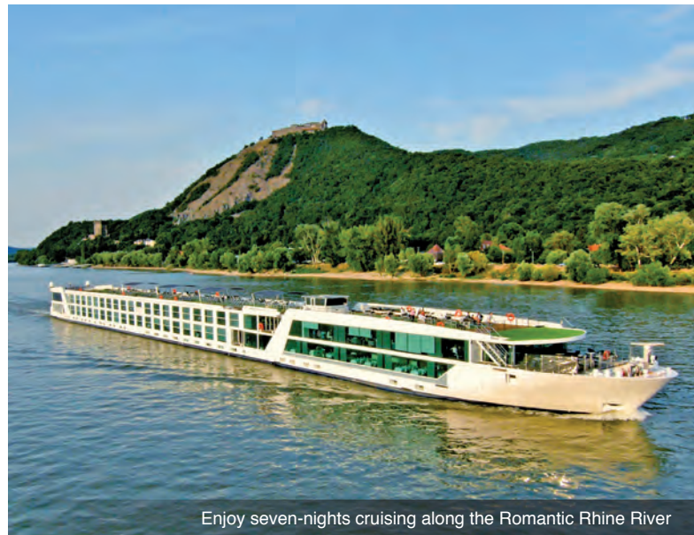
Enjoy seven-nights cruising along the Romantic Rhine River

DAY 1 Depart the USA: Depart the USA on your overnight flight to Amsterdam, the Netherlands.